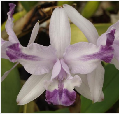
C. intermedia var. aquinii coerulea