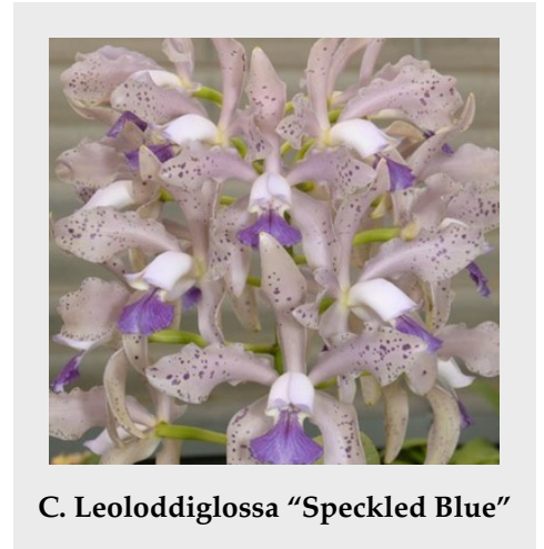
C. Leoloddiglossa "Speckled Blue"